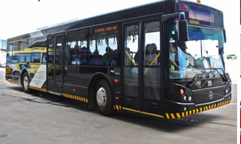
UBE Bus units are now being used for boarding and deplaning of remote-parked aircraft.

The Airport Operations Control Center (AOCC) extension office opened last month. The extended office space accommodates airline representatives as well as MCIAA to facilitate more effective communication during their respective flight operations.